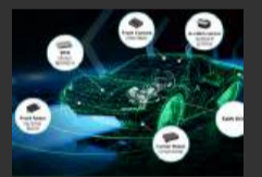
Automotive electrical components