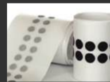
Vents for electronic devices

We can manufacture products by combining TPU and PVDF nanomembranes with fiber structures (woven and non-woven) according to meet customer needs.