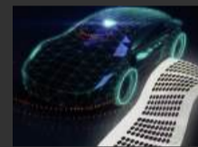
Vents for electrical components