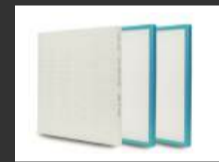
HVAC Air filter